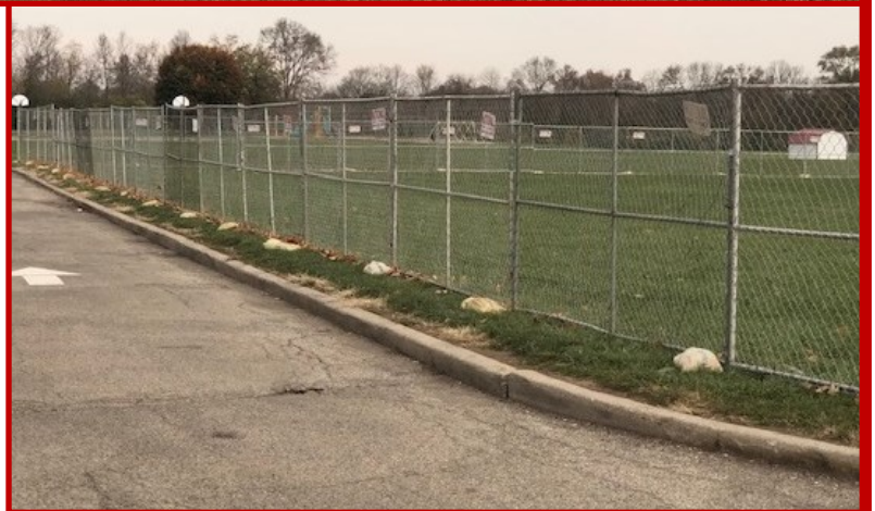
Construction photos by Larry Hook